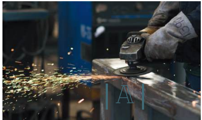
IN-HOUSE FABRICATION CAPABILITIES