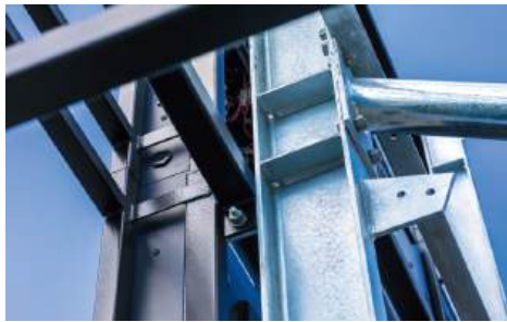
STRUCTURAL STEEL FABRICATION