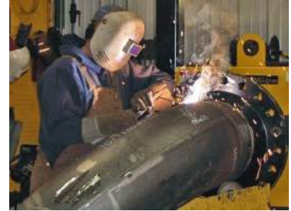
MANUFACTURING OF PUMP SKIDS