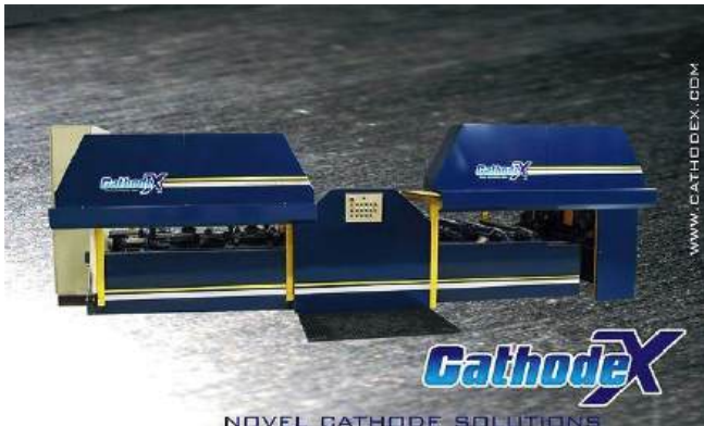
MANUFACTURING OF CATHODES AND REFURBISHMENT OF CATHODES