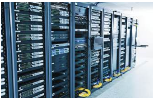
SERVERS & STORAGE