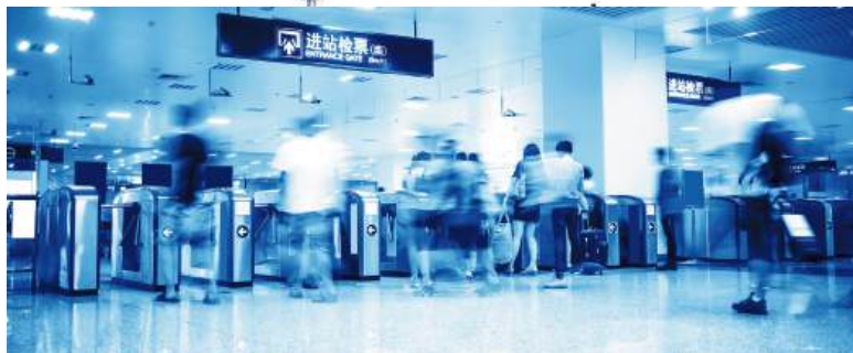
ENTRANCE SECURITY SOLUTION